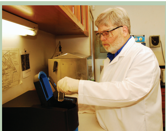
Laboratory staff continually monitor drinking water. Water quality data is posted monthly on the MCWD website (www.mcwd.org).

Fort Ord Cleanup Project: fortordcleanup.com