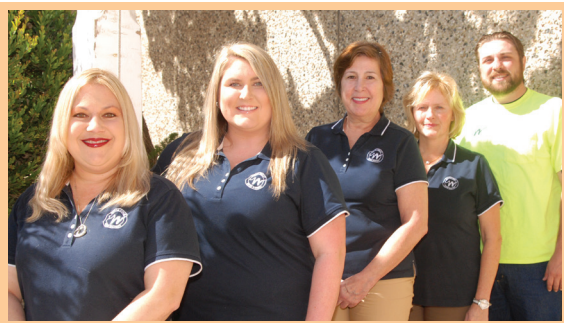
The District's Customer Service staff is available to assist you Monday through Friday, 8 AM to 5:30 PM.